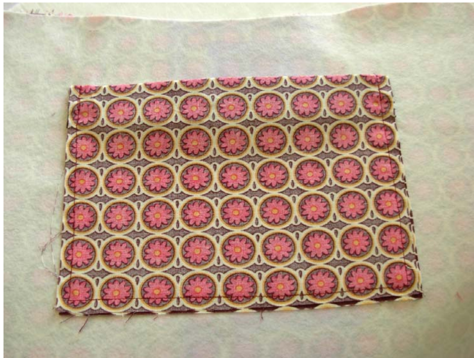
Inside view of finished bag: